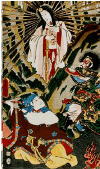
Amaterasu Emerging From Her Cave