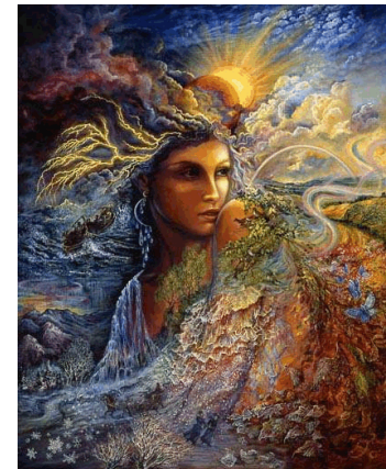
Spirit of the Elements by Josephine Wall

Celebrating the Seasons: Summer Solstice June 28, 2008